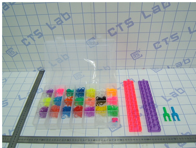
External view 2