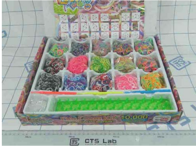
External view 3