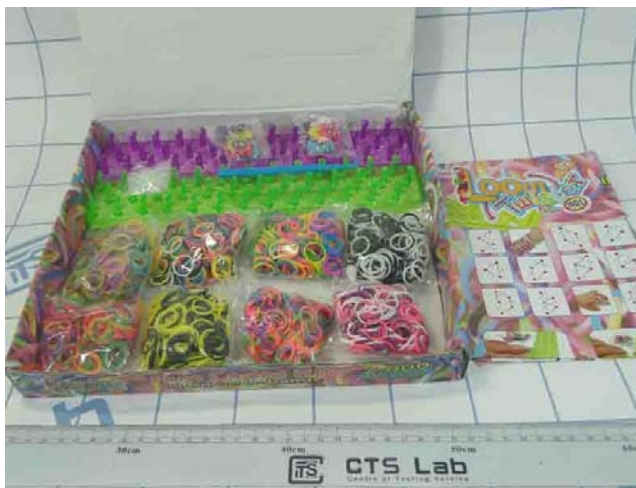
External view 7