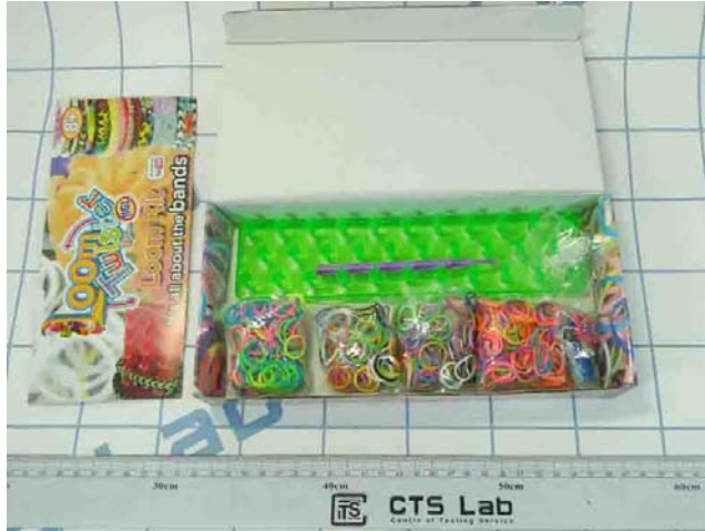
External view 5