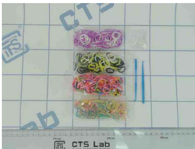
External view 8