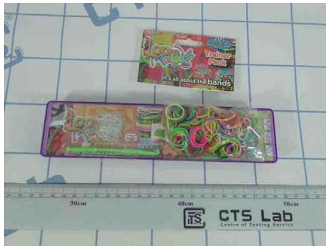
External view 4