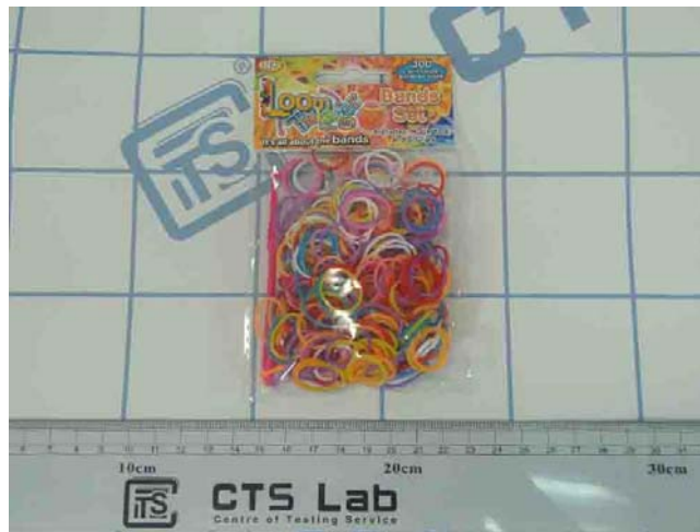
External view 6