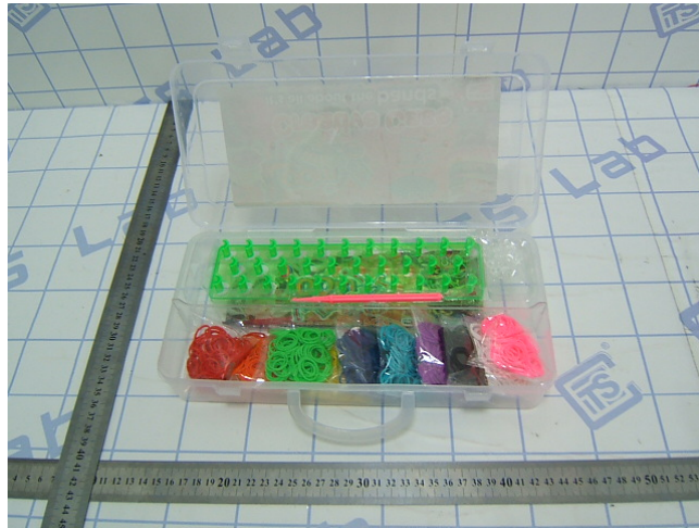
External view 1